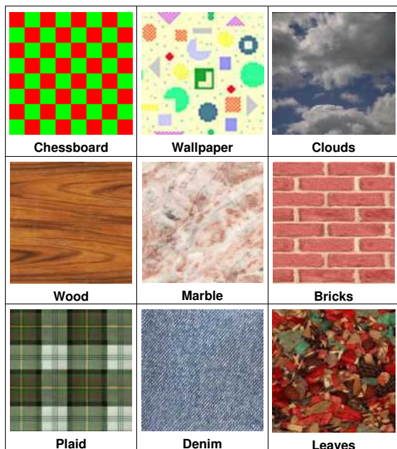
Figure 1: Nine three-component RGB images \vec{X} with Q = 256 carrying distinct textures.

second on our standard desktop computer. For comparison, another scalar parameter \sigma(\vec{X}) is also given in Table 2, as the square root of the trace of the variance-covariance matrix of the components of image \vec{X} . This parameter \sigma(\vec{X}) measures the overall average dispersion of the values of multicomponent image \vec{X} . For a one-component image \vec{X} , this \sigma(\vec{X}) would simply be the standard deviation of the gray levels. The results of Table 2 show a specific significance for the entropy H(\vec{X}) of Eq. (1), which does not simply mimic the evolution of a common measure like the dispersion \sigma(\vec{X}) . As a complexity measure, H(\vec{X}) of Eq. (1) is low for synthetic images as Chessboard and Wallpaper, and is higher for natural images in Table 2.